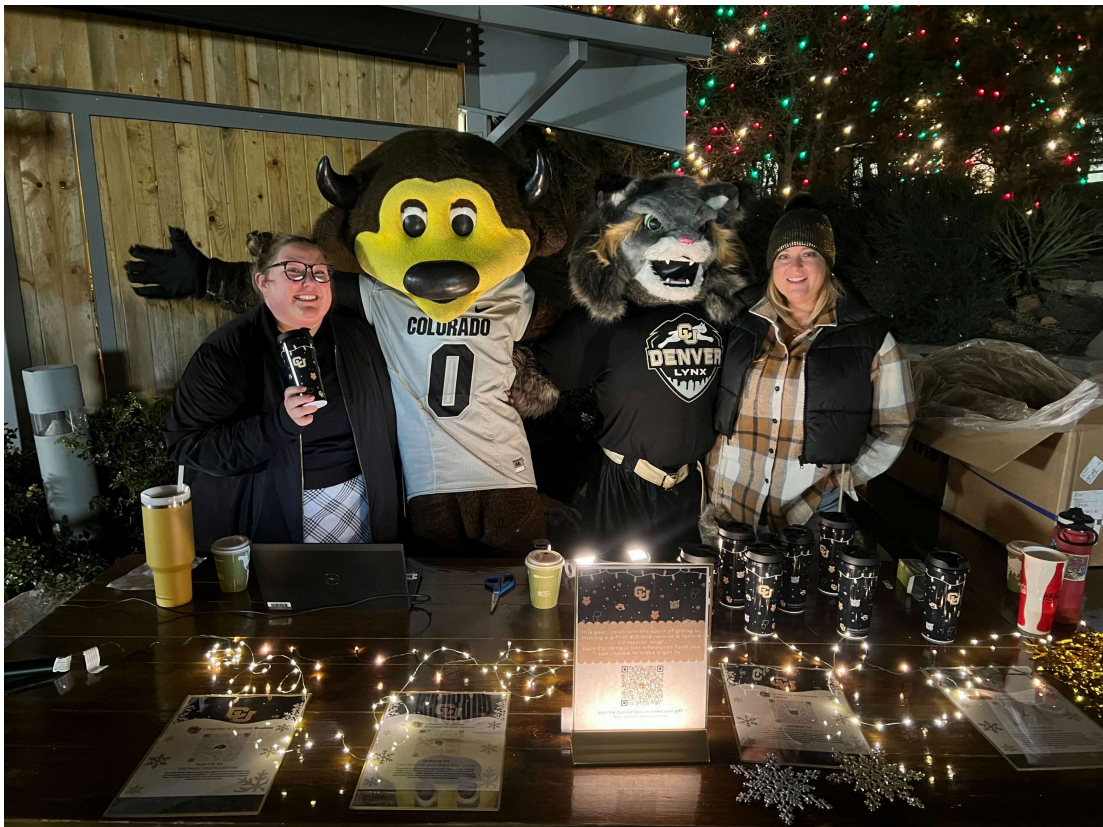
Chip, Milo and friends getting into the holiday spirit at CU Night at Zoo Lights | November 2023