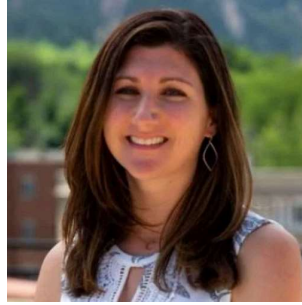
Brennan Jones Alumni Association

Staff changes are reported through Dec. 1